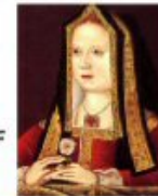
Elizabeth of York 1466 -1503