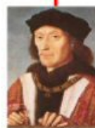
Henry VI 1457 -1509 1485 -1509