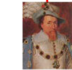
James VI of Scotland James I of England 1566 -1625 1603 -1625