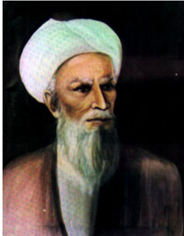
ABU BAKR (The first caliph)