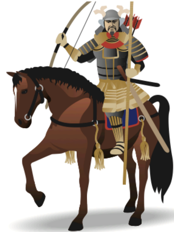
After the Heian Period, the Japanese created a military society.