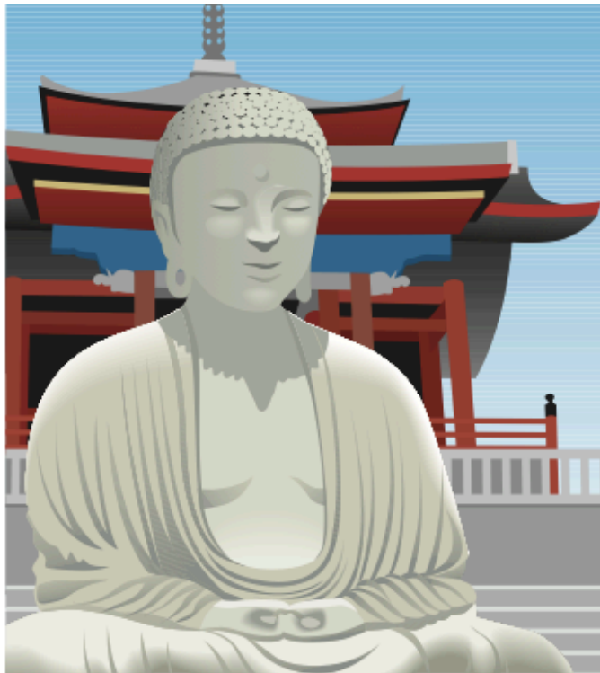
Japan's early culture was influenced by China and Korea.