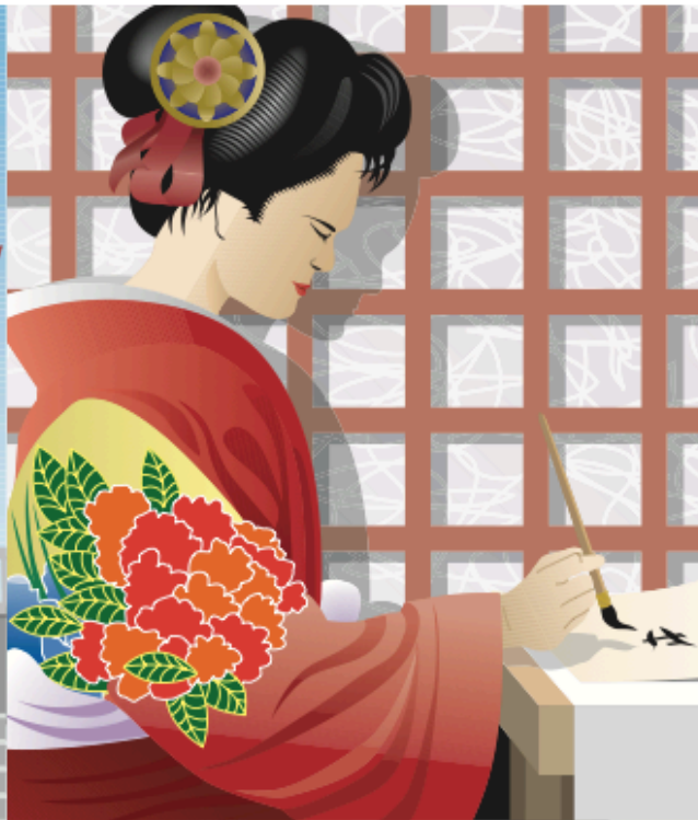
A golden age of Japanese art and culture occurred during Japan's Heian Period.